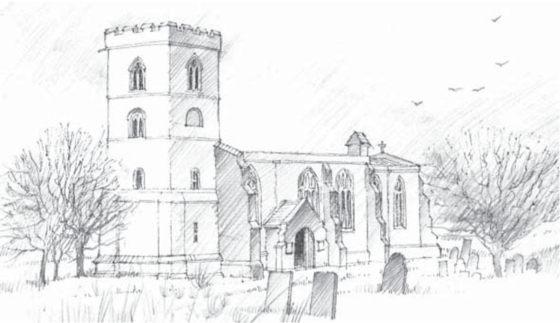
Church of Holy Trinity, Lambley