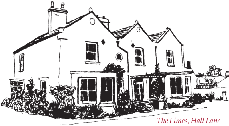
The Limes, Hall Lane

Pigeoncote and boundary walls 30 metres south-west of Hall Farmhouse, Hall Lane (Formerly listed as Old Dovecote, now Garage, Main Street)