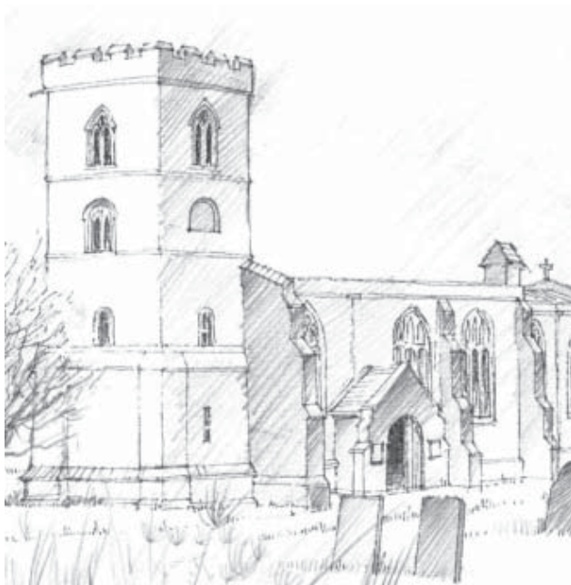
Church of Holy Trinity, Lambley