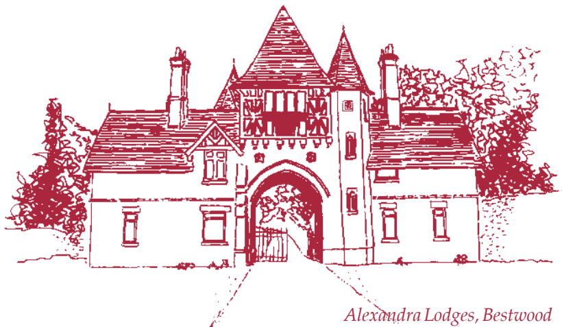
Alexandra Lodges, Bestwood

Lamp 5 metres east of West Lodge, Bestwood Pumping Station, Mansfield Road