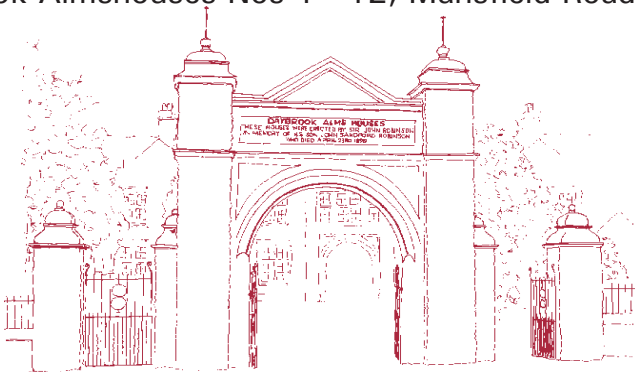
Daybrook Almshouses, Arnold

Daybrook Almshouses Nos 1 - 12, Mansfield Road