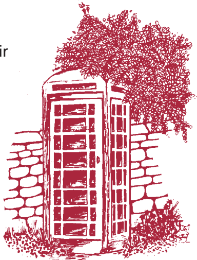
K6 telephone kiosk, Linby