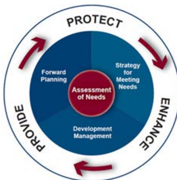
Figure 1: Sport England themes- Protect, Enhance and Provide

To provide new playing pitches where there is current or future demand to do so