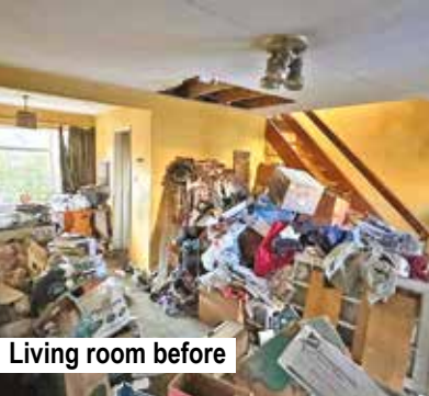
Living room before