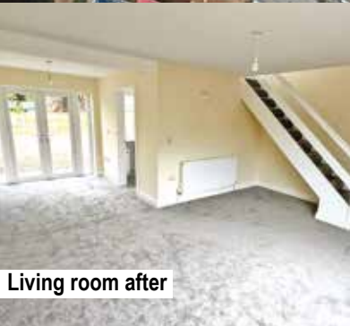
Living room after

A house that was in a terrible state due to years of neglect has been dramatically transformed and placed back into use thanks to Gedling Borough Council's Empty Property Matchmaker Scheme.