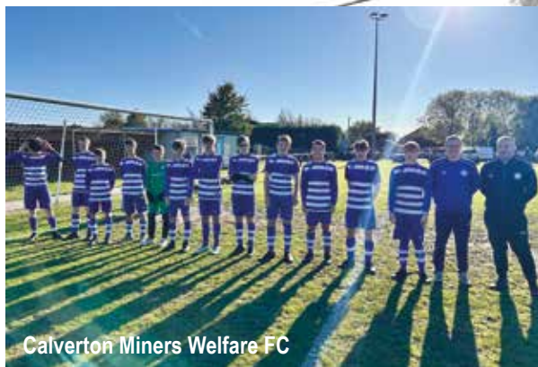
Calverton Miners Welfare FC

Several sports clubs across Gedling Borough are set to benefit from a major boost, thanks to funding secured from the UK Shared Prosperity Fund. The funding will support improvements to local sports facilities, making them more accessible and helping to enhance the community's access to high-quality sporting opportunities.