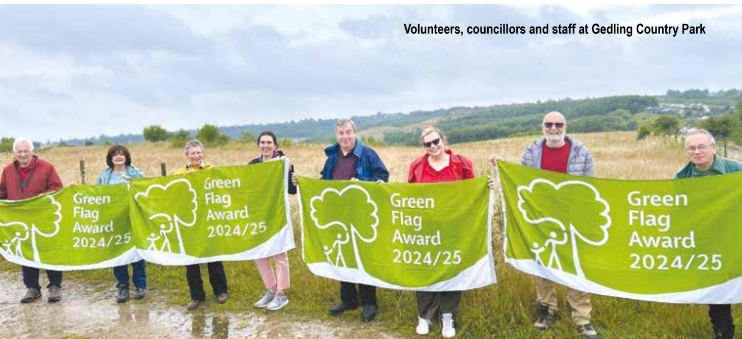
Volunteers, councillors and staff at Gedling Country Park

For more information about the Green Flag Awards and the winning parks, visit www.gedling.gov.uk and search 'parks'.